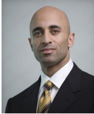
Ambassador United Arab Emirate Global Leadership