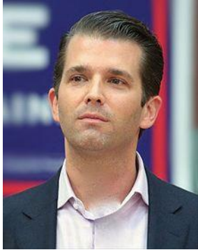
V.P Trump Organization Corporate Leadership