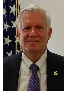
U.S Under Secretary of Commerce Policy and Commitment